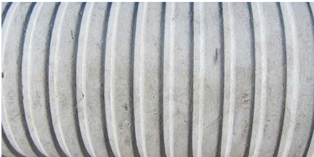
longitudinal watertight outer grooves