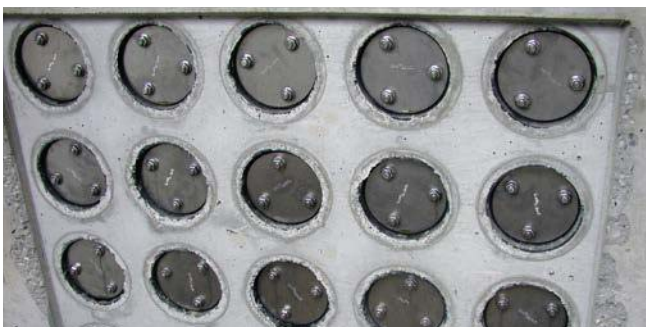
FZR 100/240 – pipe section sealing