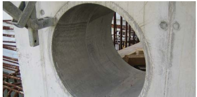
FZR 400/300 – installation in treatment plant