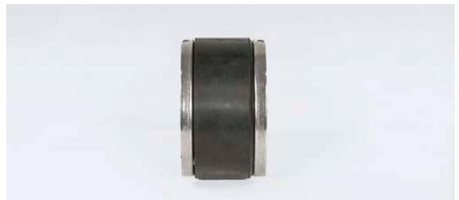
sealing width 40 mm