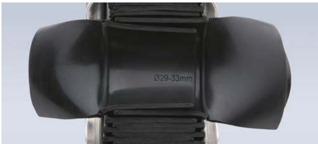
super segment ring technology with exact diameter marking