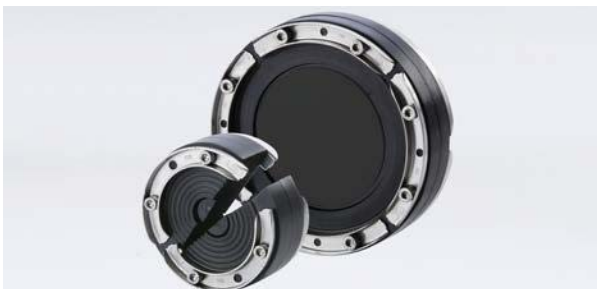
split/can be subsequently split