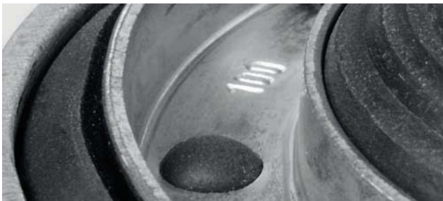
visual and tangible installation reliability due to built-in inspection opening