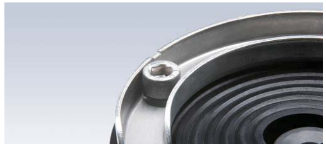
U-profile press segments made of stainless steel V2A (AISI 304L) or V4A (AISI 316L)